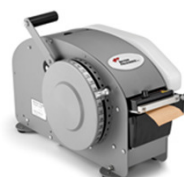
BP333 Plus with Heater